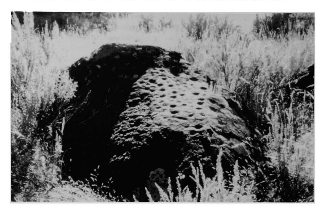
Fig. 1. Pitted boulder, Modoc County, California. Photograph by Arlene Benson, c. 1987.