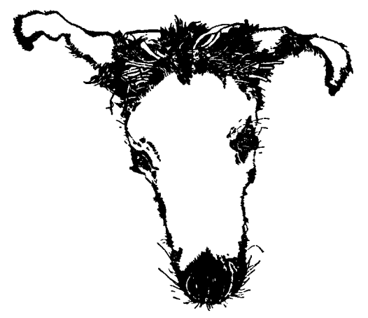
FIG. 31.—Yahi deer decoy, stuffed. (Compare Pl. 8.)

time, approximately, of the Civil War, a full dozen years after the first contact of the races. The Yahi country lay near American farms and towns, but in the early sixties did not contain permanent settlers; indeed has very few to-day. It is a region of endless long ridges and cliff-walled canyons, of no great elevation but very rough, and covered with scrub rather than timber. The canyons contain patches in which the brush is almost impenetrable, and the faces of the hills are full of caves. There are a hundred hiding places; but there are no minerals, no marketable lumber, no rich bottom lands to draw the American. Cattle, indeed, have long ranged the region, but they drift up and down the more open ridges. Everything, therefore, united to provide the Yahi with a retreat from which they could conveniently raid. Only definite and con-