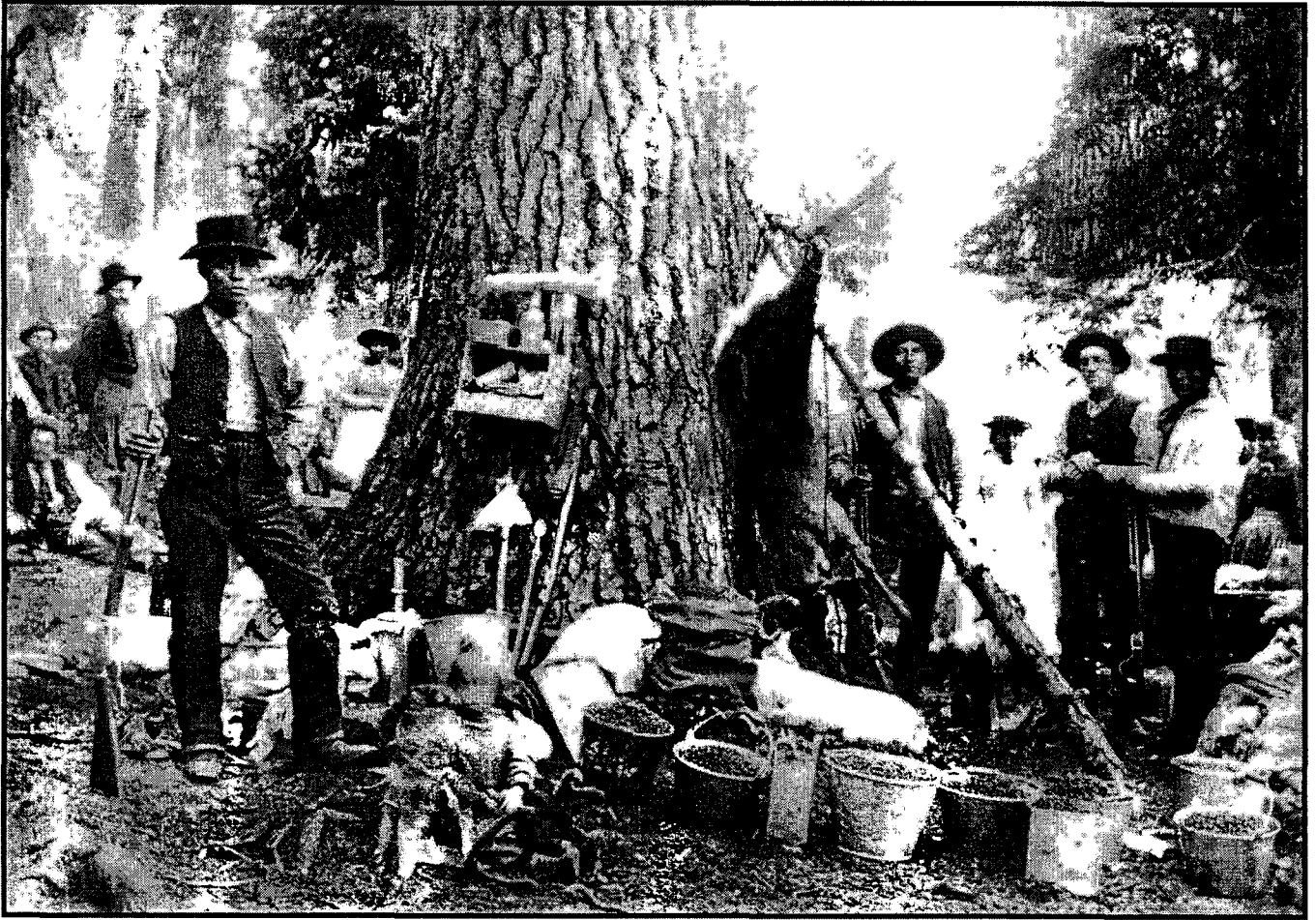
A photo taken in the campsite area of Huckleberry Mountain, circa 1900. A longstanding geographical nexus of American Indian resource activities and social life, Huckleberry Mountain had become an important place to both white and Indian families by this date. Buckets of huckleberries and a freshly dressed deer in this photo reflect the importance of this area in the domestic economy of local families, particularly among members of the tribes of southern Oregon. The multiethnic character of the group assembled for this photo hints at the role of this place as an enduring geographical locus of inter-tribal and cross-cultural interaction, a role that it continues to play to some degree into the present day.