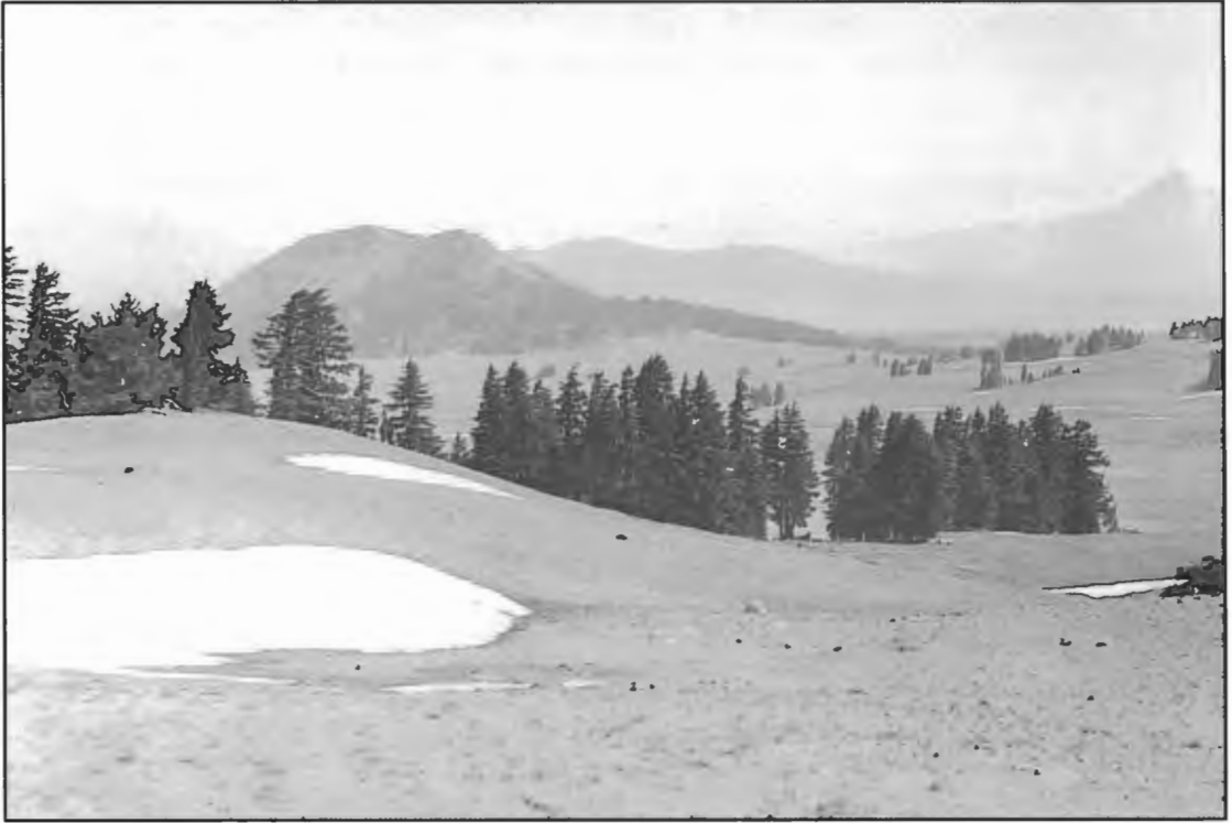
The “Ball Field,” a gently sloping, largely treeless area on the northwestern edge of the caldera, is shown here in about 1935, with Red Cone and Mount Thielsen in the distance. According to Klamath oral traditions, this site was devegetated during a contest — a rowdy ball game — between supernatural beings, Llao and Skell, and their assembled minions of mythic creatures.

ical affiliations with the Crater Lake area, including members of the Cow Creek Band of Umpqua Indians and the Modoc Tribe of Oklahoma. This article is largely a product of this three-year investigation.