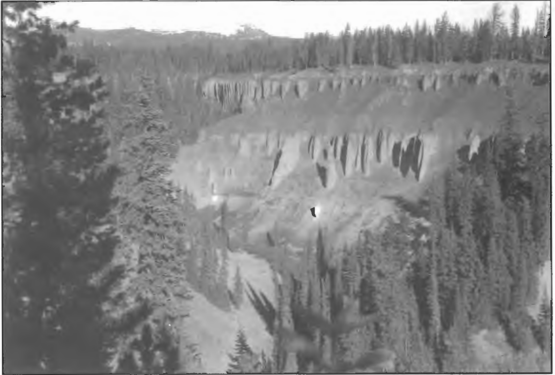
This 1940 photograph shows the dramatic landscape of Godfrey Glen, also known as the Garden of the Gods, which is located along Annie Creek in Crater Lake National Park.

association with the volcanic landscapes of this region. Klamath legends of the eruption of Mount Mazama, passed from generation to generation, provide a striking corroboration of scientifically verified geologic accounts.