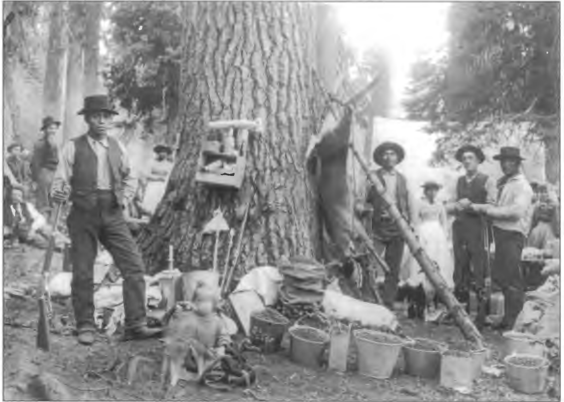
Phil Kelley, cartographer, courtesy NPS

By 1900, when this photograph of a campsite at Huckleberry Mountain was taken (above), both white and Native families gathered near the mountain's summit each summer to pick berries, to hunt, and to socialize. Buckets of huckleberries can be seen in the foreground, while bags of huckleberries and a freshly dressed deer are against the tree. Each year, families carried a wide range of lightweight household implements to the site by horseback. The map on the right shows where Huckleberry Mountain is in relation to Crater Lake.