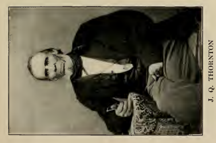
Judge of the Provisional Supreme Court, who made the mission to Washington in 1948.