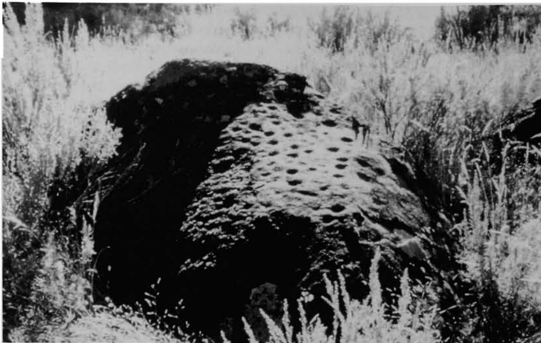
Fig. 1. Pitted boulder, Modoc County, California. c. 1987.